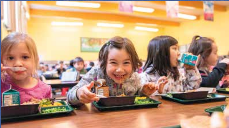
Students in Portland Public Schools enjoy our Umi Yakisoba.