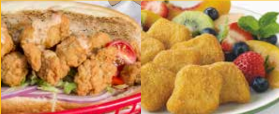
90008 | WG, NAE Popcorn Chicken, White Meat