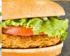
90013 | WG, NAE Chicken Patty, White/Dark Meat 90014 | WG, NAE Chicken Patty, White/Dark Meat Spicy